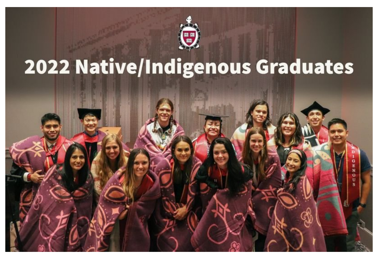
Congratulations to our 2022 Harvard Native/Indigenous graduates! (Harvard University Native American Program)