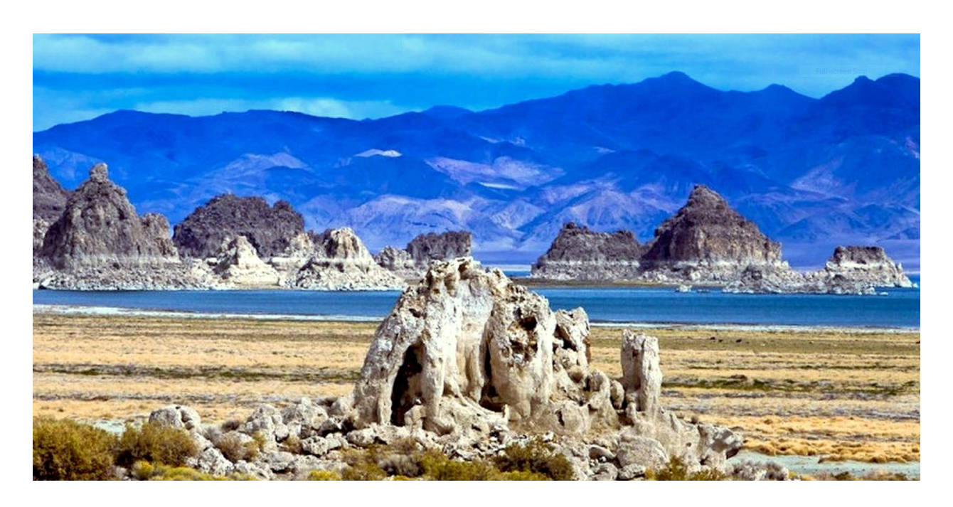
The North End of Pyramid Lake by Dee Numa Note the water line citing the original level of the ancient Lake Lahontan

Tis the Season! Congrats to ALL Graduates