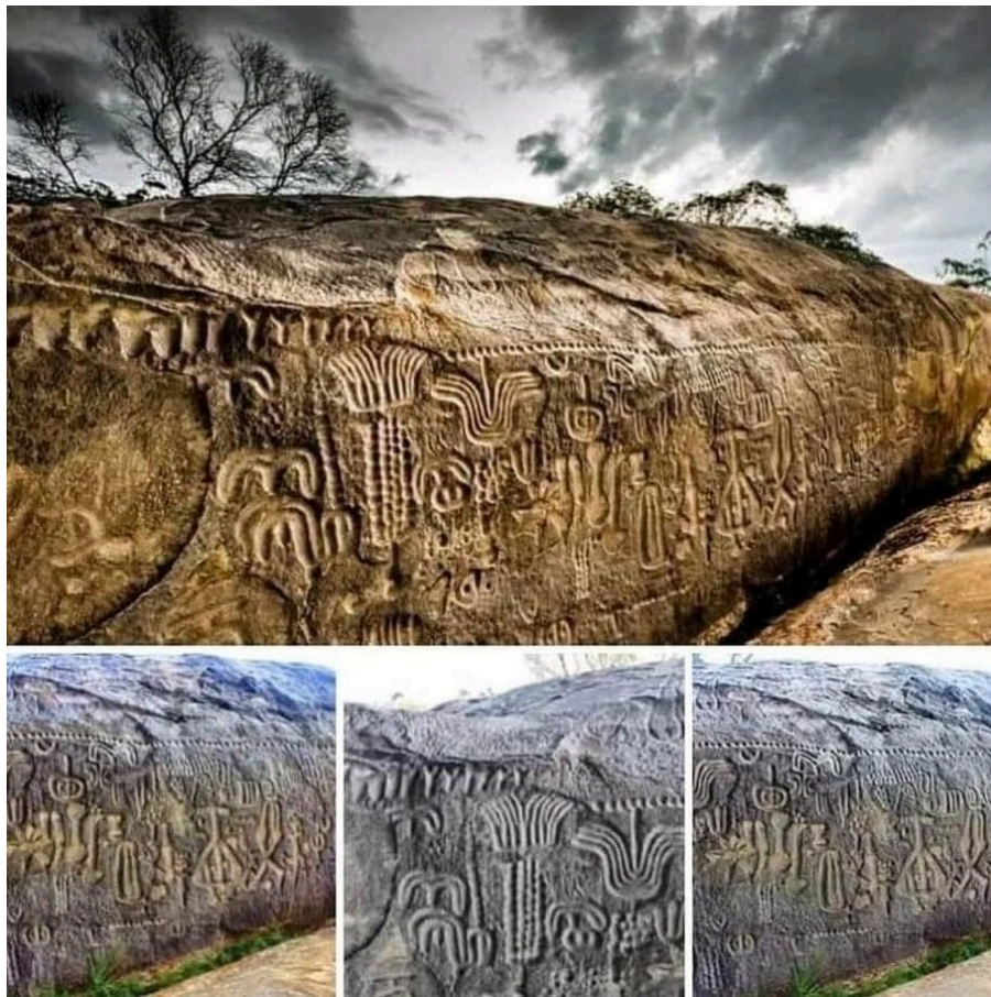
THE INGÁ STONE

Workshop on Green Extractivism in Ontario