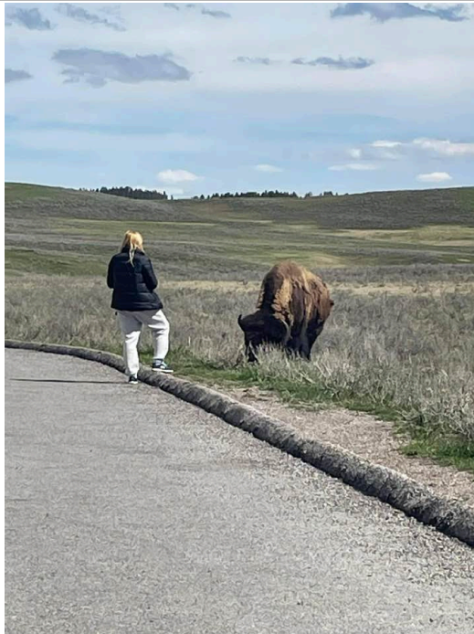
Here we go again tourist tossing season is open.

Outside of the former Confederacy, efforts to replace "Pioneer Mother" statues with depictions of Native American women have sparked a backlash including outright theft.