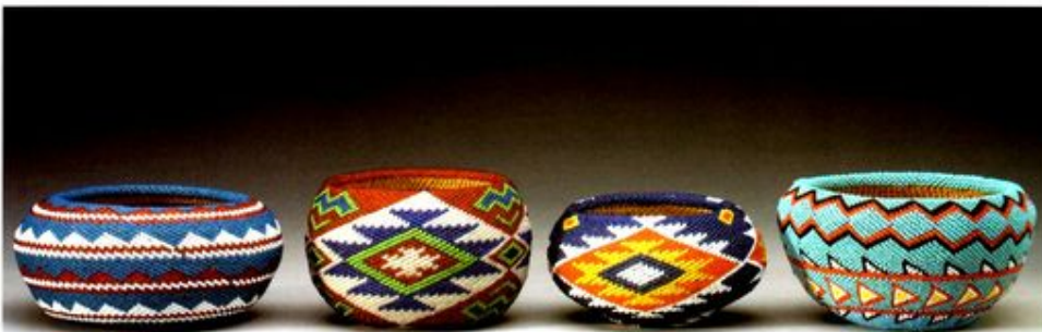
25 (163 Bridgeport Museum number) - WASHOE OR PAIUTE BEADED BASKET. Willow, 11/0 Czech and Italian glass seed beads, white cotton thread. 5½" x 2¾"

Basket is somewhat coarsely woven, single-rod, interlocking stitch, with one coarse and several short bars worked in dark brown dyed split willow. Basket has a transparent dark blue background with a serrated diamonds motif, worked in white, red, and yellow.