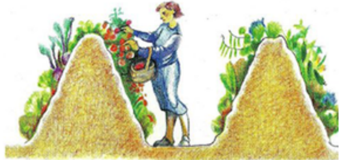
Above: These steep raised beds are the perfect height for harvesting without having to stoop.