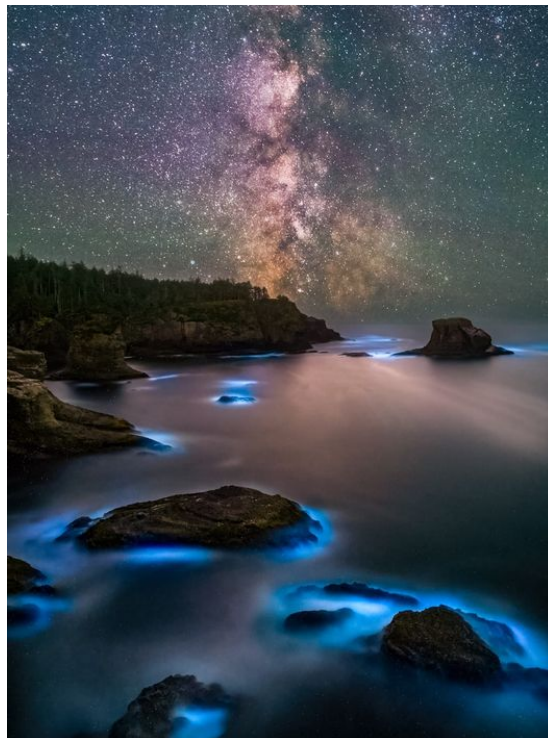
Mathew Nichols Photography is in Neah Bay, Washington.