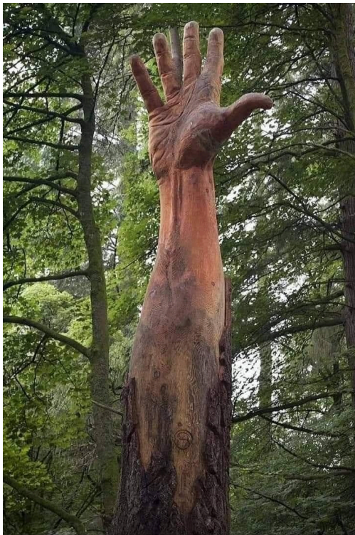
We Don't Deserve This Planet