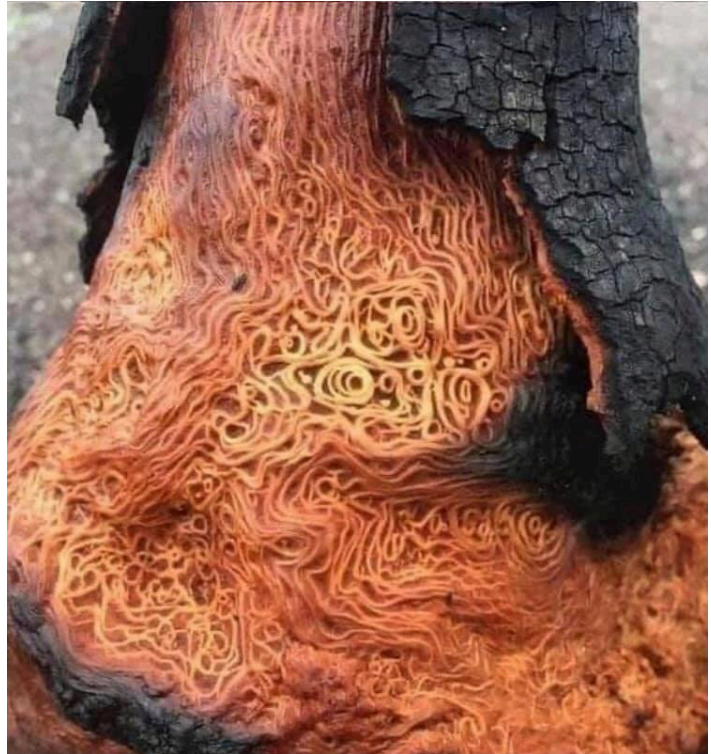
NatureVibes · This tree has been struck by lightning exposing it's vascular system