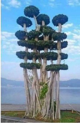
A sculpture of life's struggles.