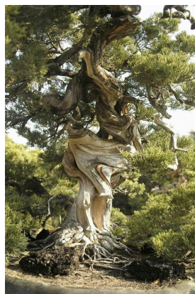
800 Year Old Oak