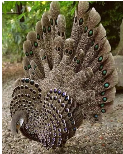
La belleza de la naturaleza...!!!

AAHA is hosting an exciting and interactive three (3) day online training with a half day (10/28/2022) being available for participants to schedule a one-on-one session with the trainer. The training will provide attendees with a comprehensive introduction to the Native American Housing Assistance and Self Determination Act of 1996 (NAHASDA). Participants will become familiar with latest regulations, program guidance, and PIH Notices. A thorough review of eligible families and eligible activities including rental housing, homebuyer programs, rehabilitation and housing and crime prevention services will be provided. Other major topics to be addressed include the Indian Housing Block Grant (IHBG) formula, calculating income eligibility and adjusted gross income, moderate-income family assistances, income verification. When: 8:30am – 3:30pm AK