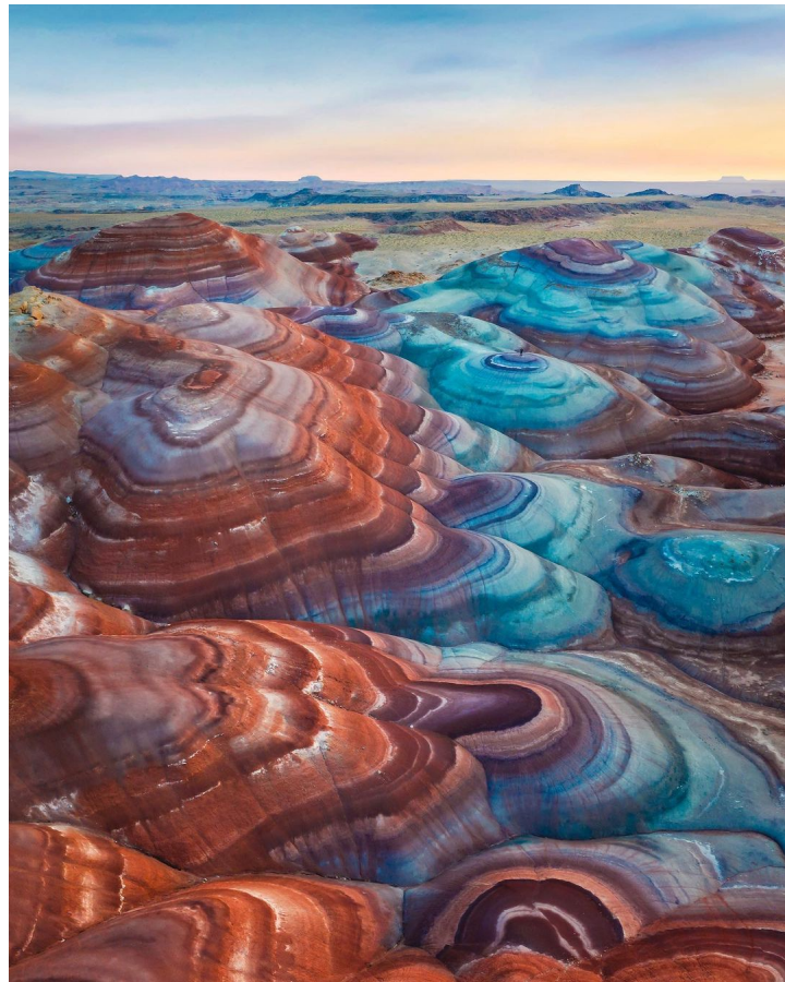
A sunrise over the colorful landscape of Candyland in Southern Utah ,USA! instagram.com/davidmrule