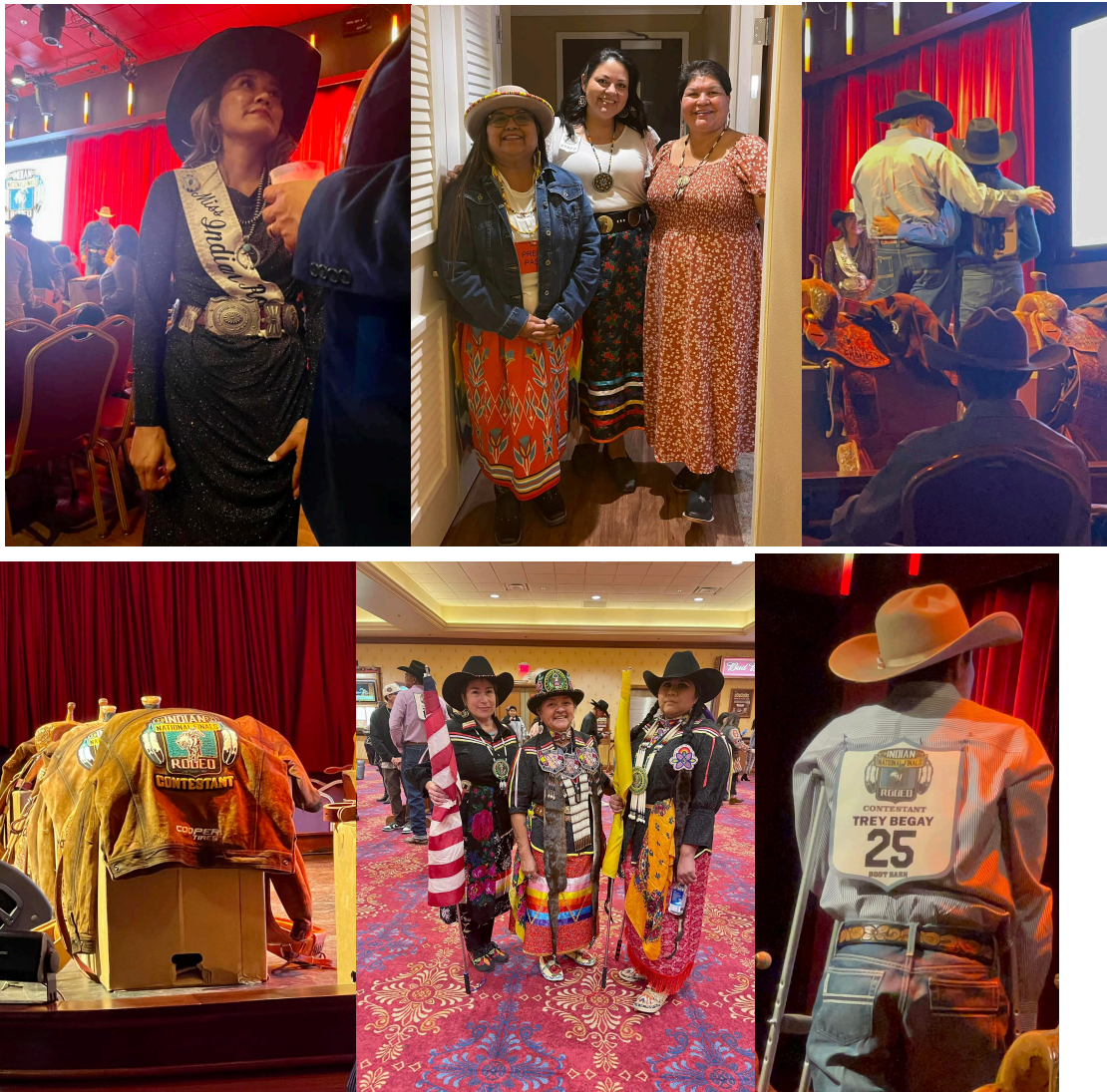
Veteran Honor Guard

Congratulations to all the Champion Cowgirls and Cowboys.