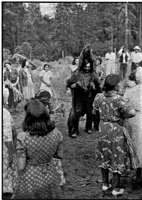
Maidu group preparing for a Bear Dance - circa 1948

Arizona Republic, 10/18/22 - The Gila River Indian Community is the first Arizona water rights holder to publicly pursue the federal government's new offer of compensation to leave Colorado River water in Lake Mead.