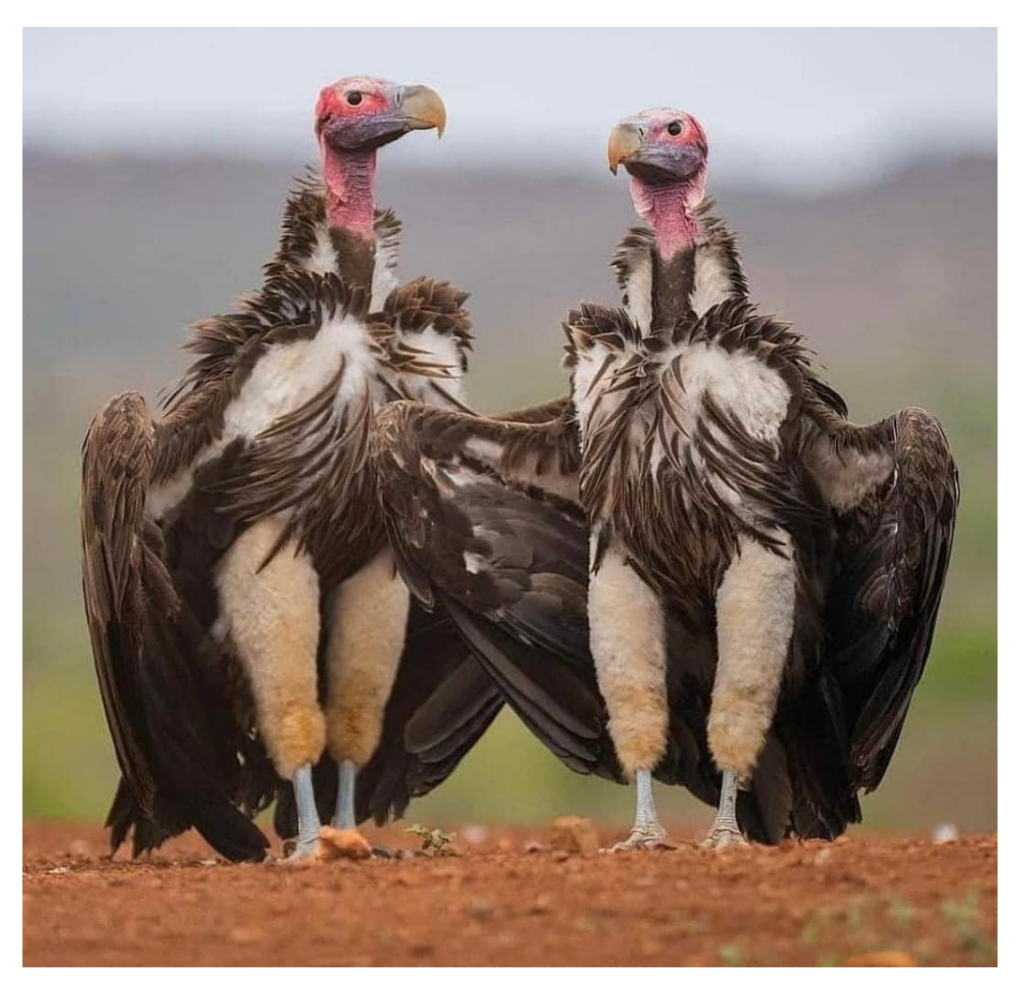
Two Lappet-faced vultures showing off their legs