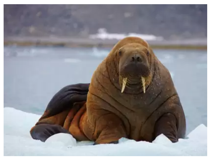
Take a chance to become a walrus detective. (great story) https://www.thrillist.com/news/nation/walrus-detectives-world-wildlife-foundatio

https://plpt.nsn.us/broadband/? fbclid=IwAR3QMT98WvB5JdAFwrNNoLgWRSt_EN1U11SQDPt9qlx1EodrtHH DirpOCO0