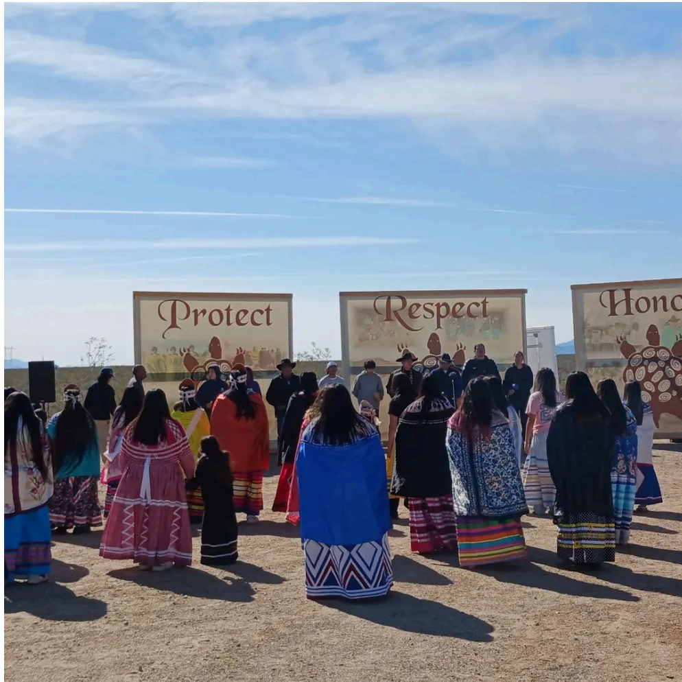
Ward Valley Spirirual Gathering.