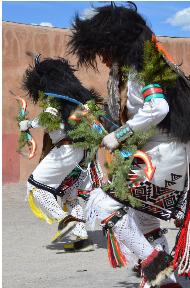
Tewa Buffalo Dancers at Ohkay Owingeh Pueblo, NM. Photo used with permission from Butter Garcia (see “Return of Icon” p.6)