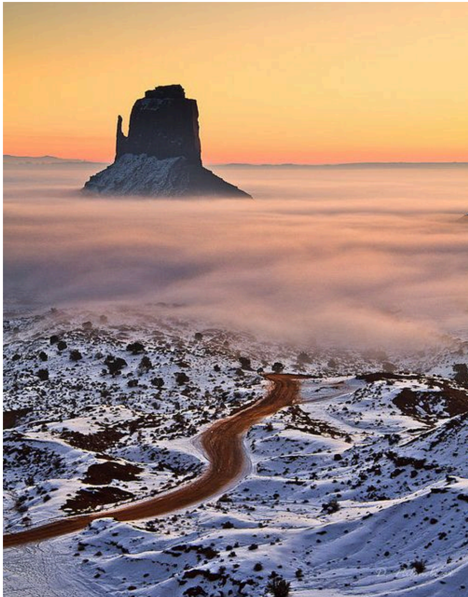
Monument Valley · · ·