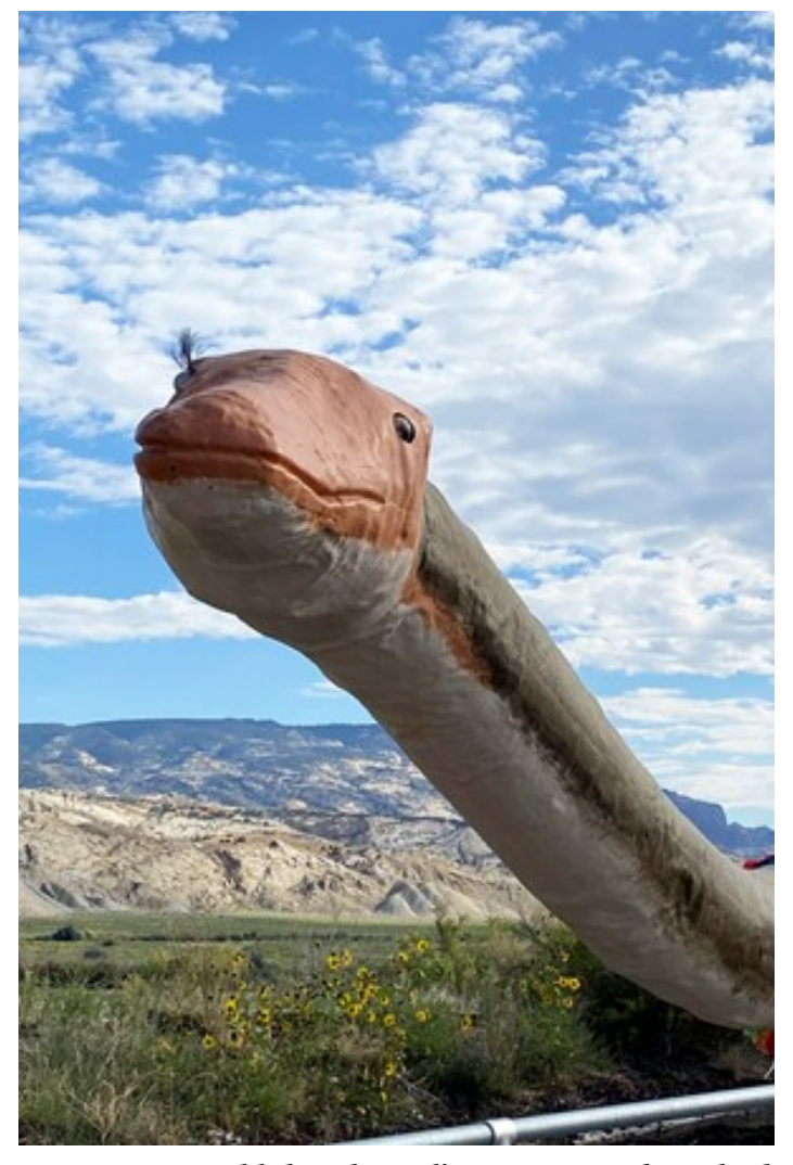
"...somewhere up there are stars so old that those dinosaurs may have looked up and seen them, too."