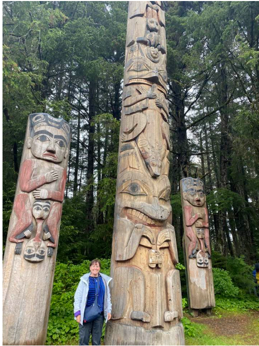
Totem Museum. Sitka National Historic Park Alaska NPS.gov