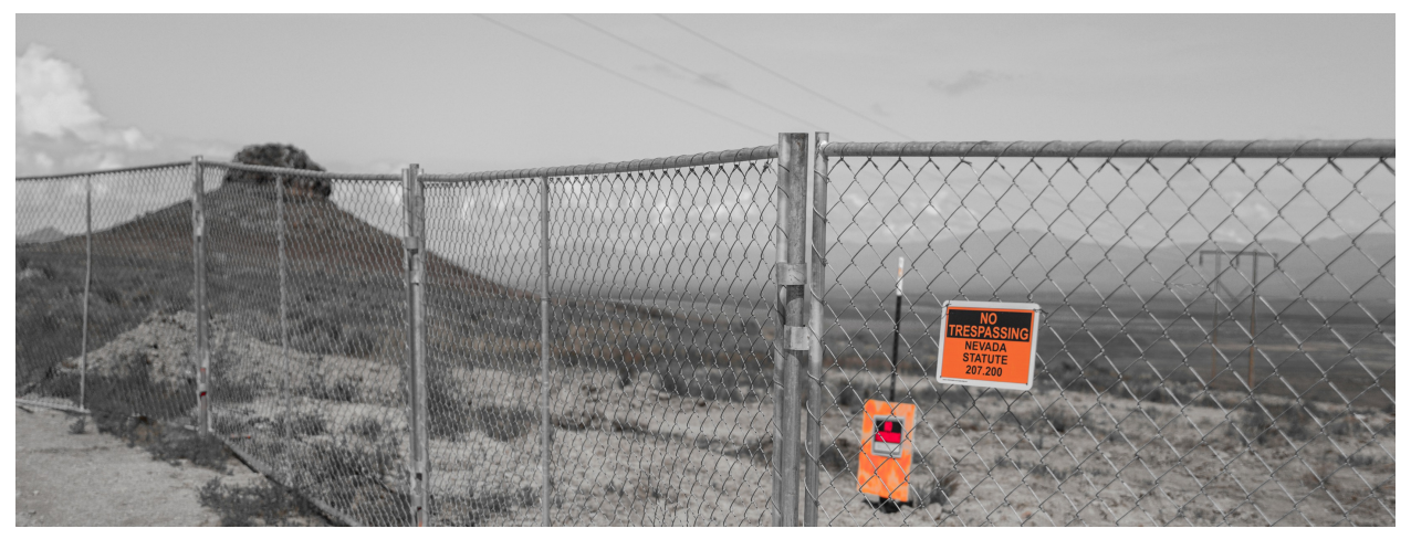
No Wonder Tesla Built Its Gigafactory Here

https://markettactic.com/lithium-supply-crisis-why-its-worse-than-you-think-3/5541232/