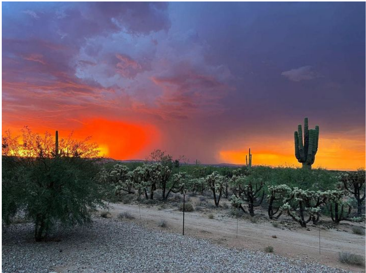
Monsoon Sunset Unnamed winner of contest in Vail AZ