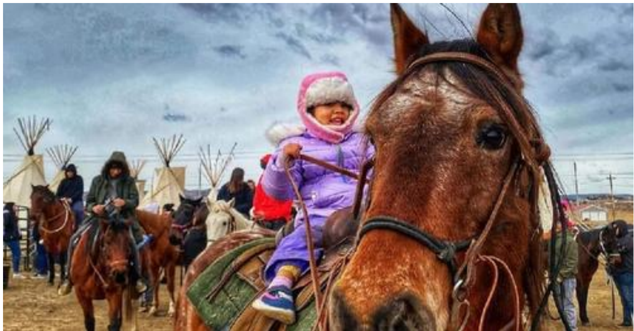
from the Healing with Horses Camp (July 2023)