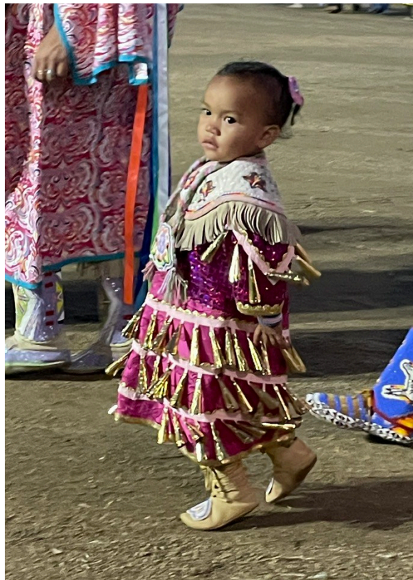
Numaga Pow Wow