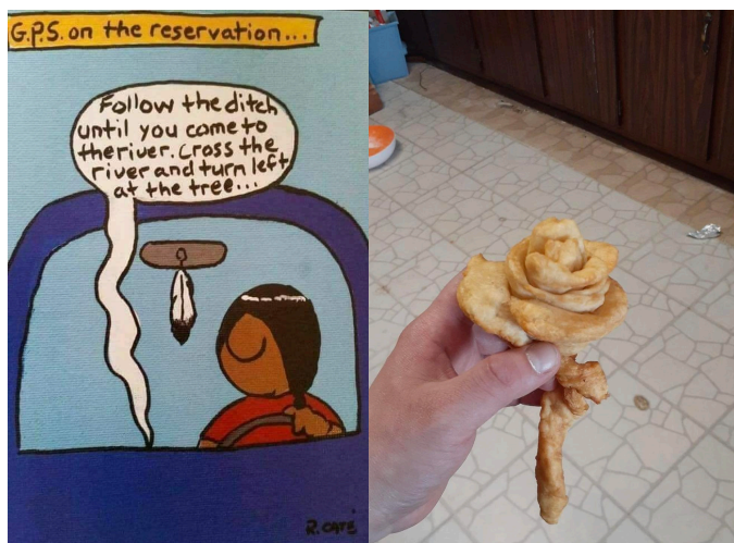
Native Stories, Myths And Legends · Native Peoples · ·

ABOUT : PROGRAMS ADMISSIONS & AID HEALTH, SAFETY & WELL-BEING MEDIA CENTER BLOG ABOUT: This is SIT How We're Different Faculty & Staff Career Impact