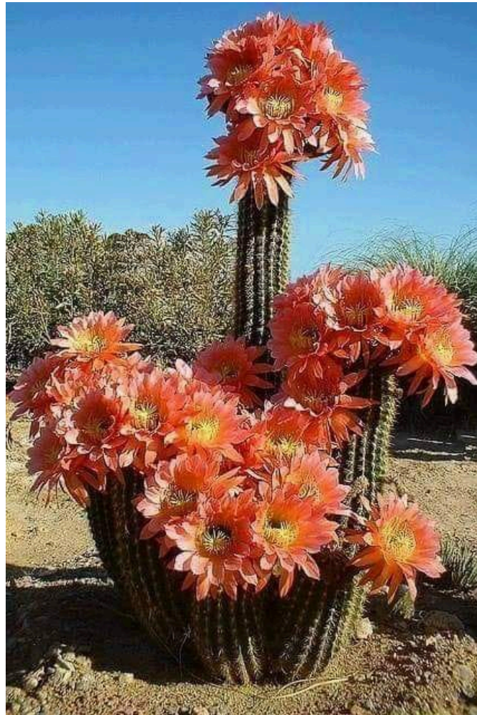
Huge wild full bloomed cactus in Arizona

Researchers constructed material capable of generating near-constant electricity from ambient air