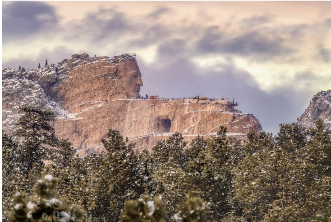
Beautiful sight from all angles and every season. credit - IG user @the.deis — at Crazy Horse Memorial

Friends Committee on National Legislation