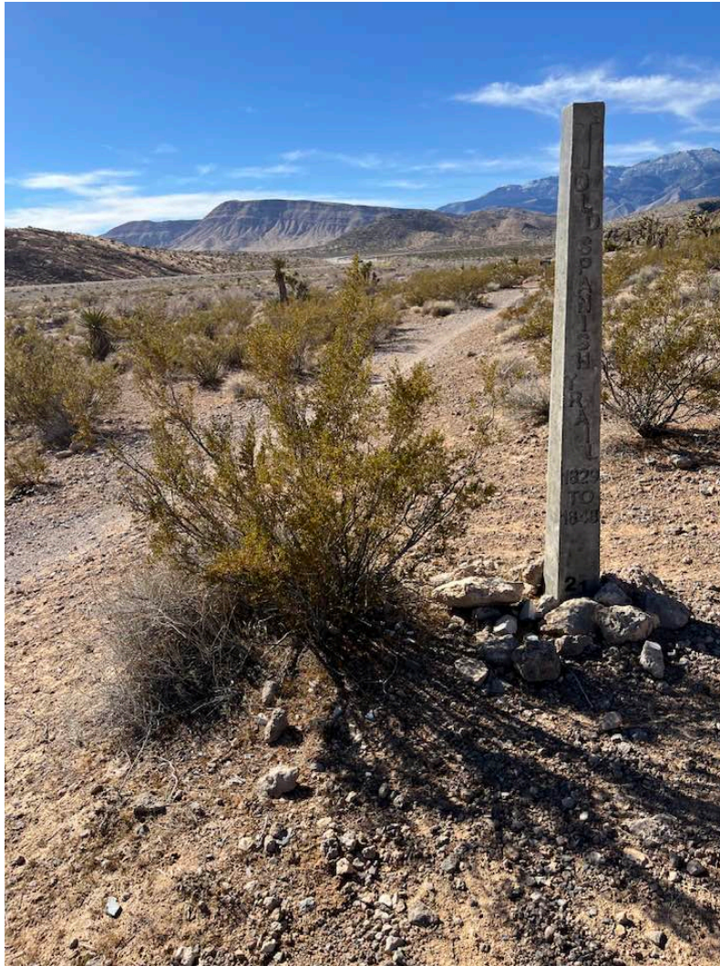
Marker for “The Old Spanish Trail” Las Vegas, Nevada

26th Annual American Indian Tourism Conference