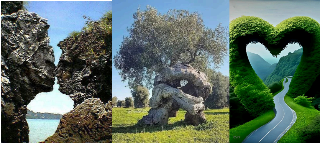
This olive tree is over 1600 years old and they compared it to a hug.. It is in Salento, Puglia, Italy.