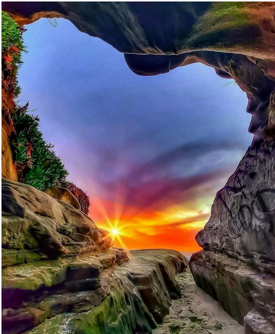
Sunrises n Sunsets · Nathada Boland