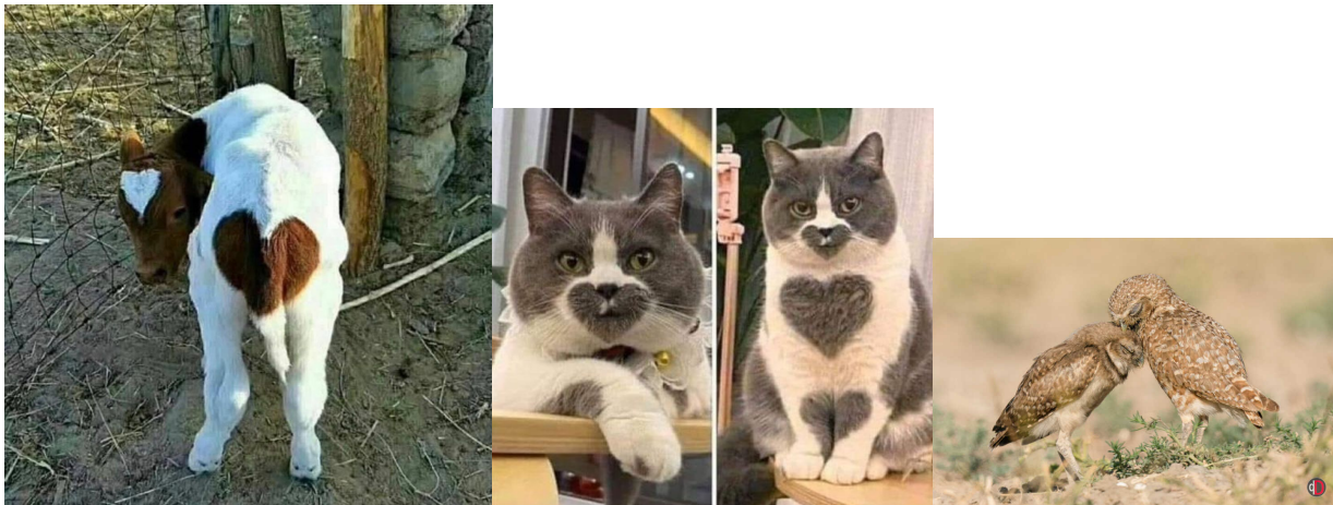
Kitty with a message for the world

And since I haven't done 2022 holiday cards, nor anything for 2023, consider yourself acknowledged and celebrated with Valentine's greetings! sdc