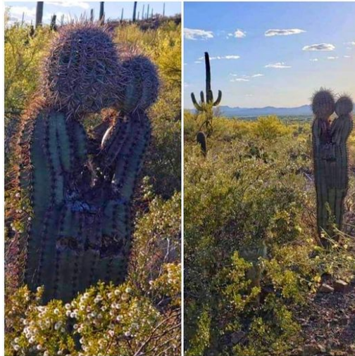
In the Sonoran desert, this plant grew in the form of a couple embracing and melting into a kiss. Nature is amazing!

“A kiss is a lovely trick designed by nature to stop speech when words become superfluous” — Ingrid Bergman