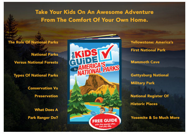
thekidsguide.com Every child deserves to see our National Parks The Kids Guide to National Parks

That's why we're giving away our Kids Guide to America's National Parks for *free*. You just pay s&p with this special offer. So, give your kids a taste of gorgeous parks with this fun and free guide!