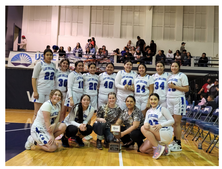
The McDermitt Lady Bulldogs

Great Basin Sun is at Virginia Street Gym · Reno, NV ·