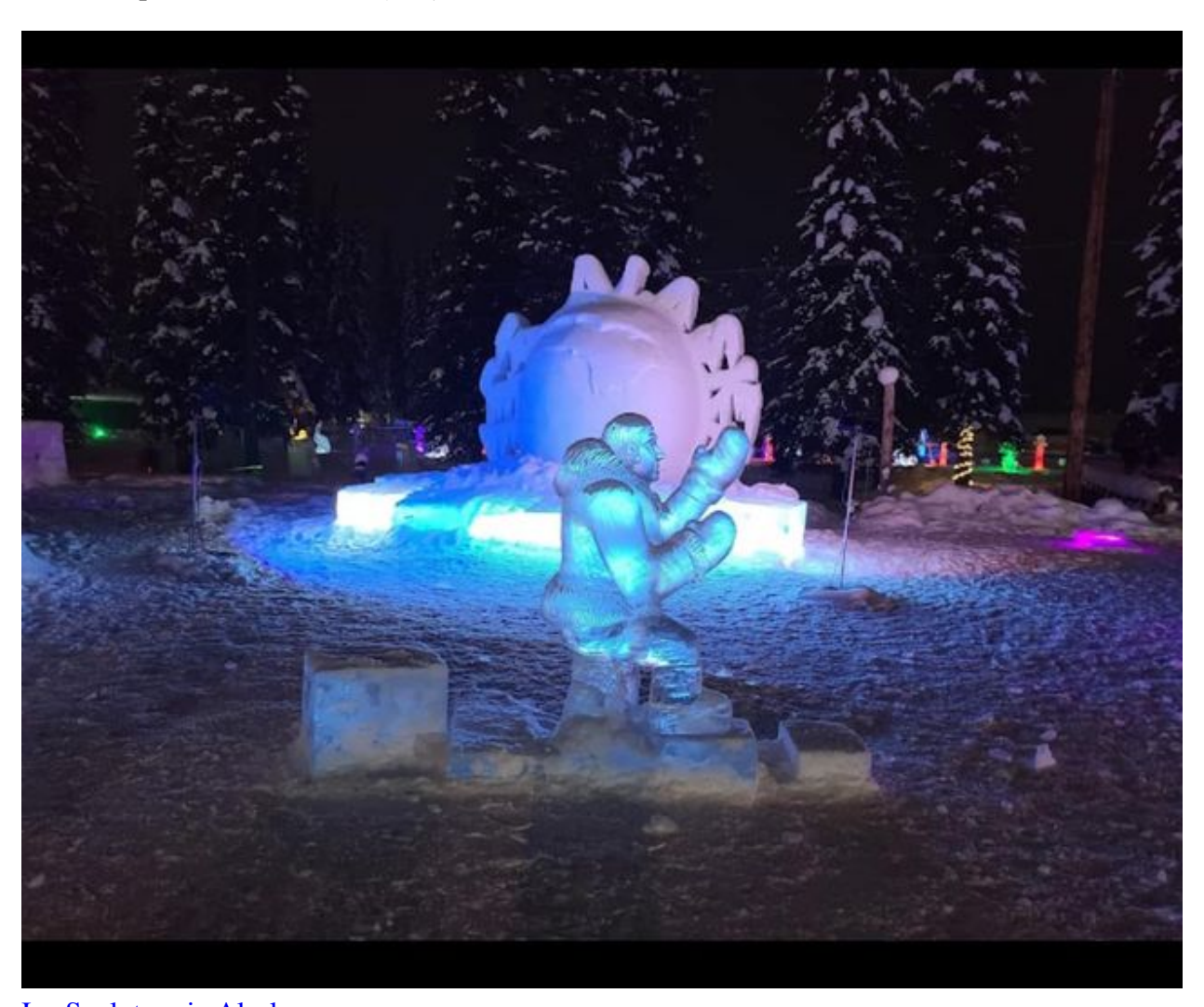
Ice Sculpture in Alaska