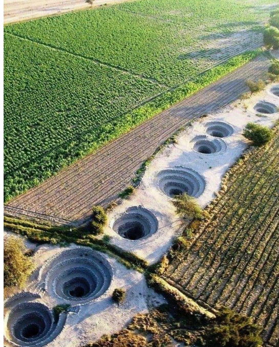
David Attenborough Fans

The Cantaloc Aqueducts, built by the Nazca people in the Peruvian desert 1,500 years ago, are still in use today. The uniquely shaped holes allow wind to blow into a series of underground canals, forcing water from underground aquifers into areas where it is most needed. More images/info: http://bit.ly/3T64kOB