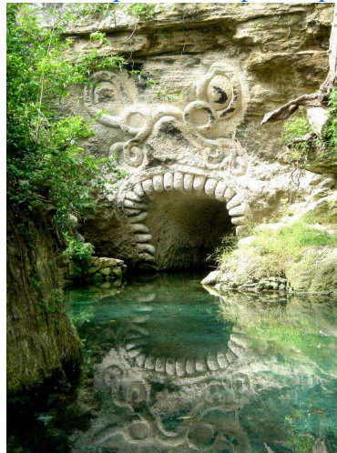
entrance to Mayan cave

Read in National Geographic: https://apple.news/AvLpYAftcRYqwURIp8Ym8jQ