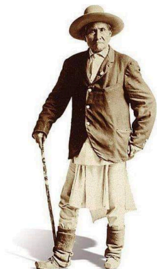
Native American Tribes