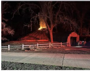
Fire at Indian Grinding Rock State Historic Park