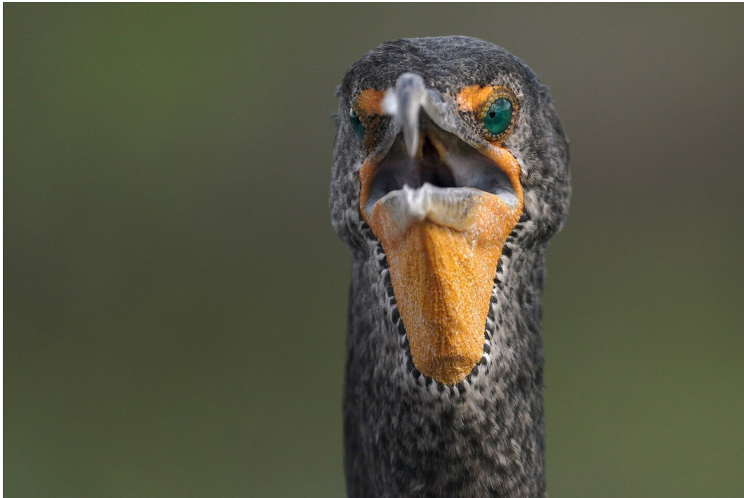
A double-crested cormorant in the Everglades National Park in Homestead, Fla., on Jan. 30, 2023.

Layoffs begin at US health agencies responsible for research, tracking disease and regulating food