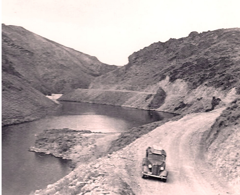
Wild Horse, 1939

https://parks.nv.gov/learn/park-histories