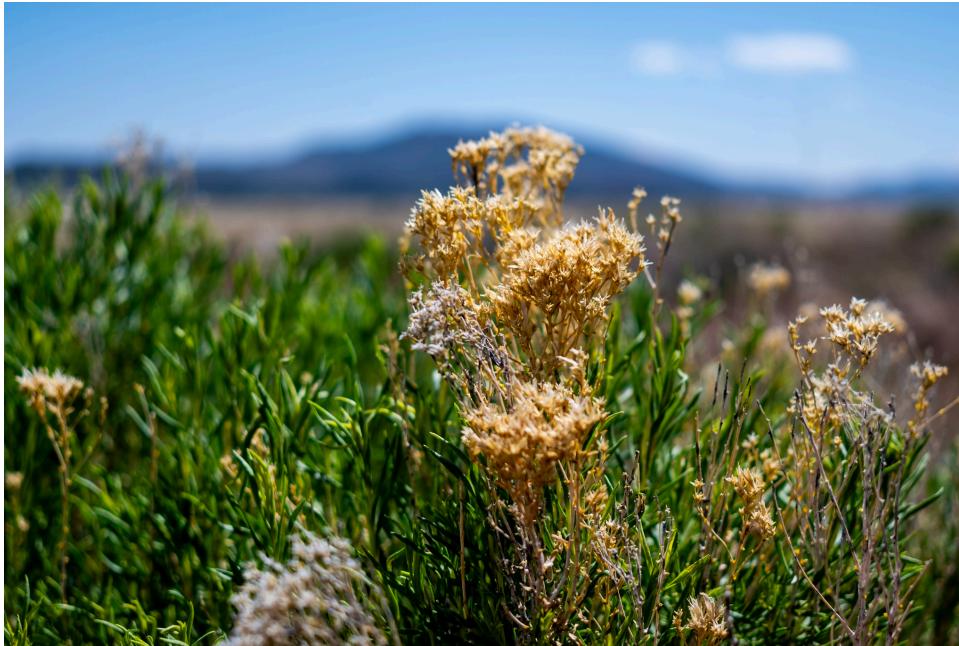
by Bucky Harjo