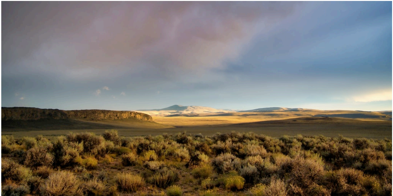
Mortimore's acclaimed photograph The Sun Slides to the West , sierranevadaally.org/2025/07/02/learning-to-see/

OpenAI to offer the enterprise version of ChatGPT to federal agencies for $1