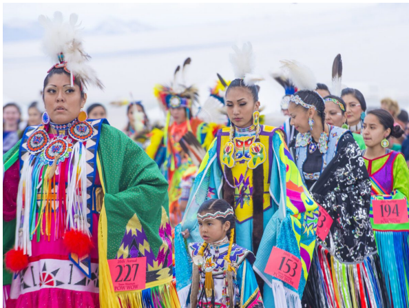
Native American women take part in the 26th Annual Paiute Tribe Pow Wow in Las Vegas, Nevada.

Trump team readies more attacks on mainstream climate science