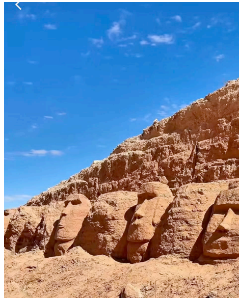
Little Mount Rushmore Mesquite, Nevada